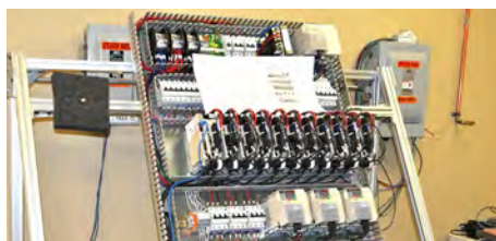
4 UL508A INDUSTRIAL CONTROL PANELS