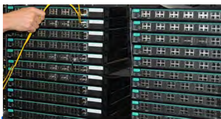
1 NETWORK CONFIGURATION & TESTING