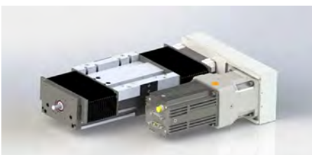
5 MECHANICAL SUB- ASSEMBLIES & STAGES