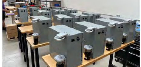
6 Contract Manufacturing Services