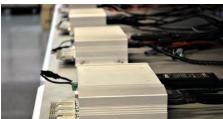
4 COPY EXACT & GOLD IMAGING