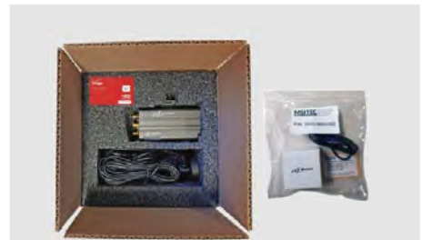
3 CELLULAR PROVISIONING & ACTIVATION