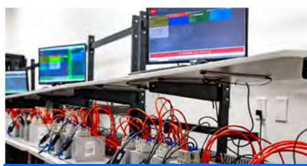
2 24-HOUR BURN-IN TESTING ON ALL PC BUILDS