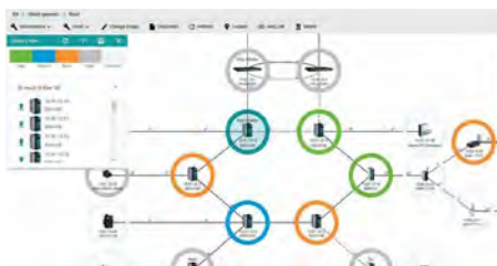
5 CYBERSECURITY AUDITS & CONSULTING