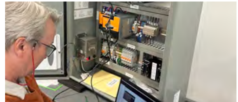
3 FUNCTIONAL SYSTEM TESTING