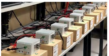
6 OEM SERVICES & PRIVATE LABELING